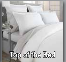
Top of the Bed

etcetera... international Housewares, Linens and Supplies for your condo or hotel